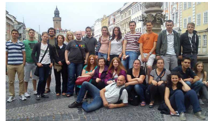
Fellowship recipients during a city tour